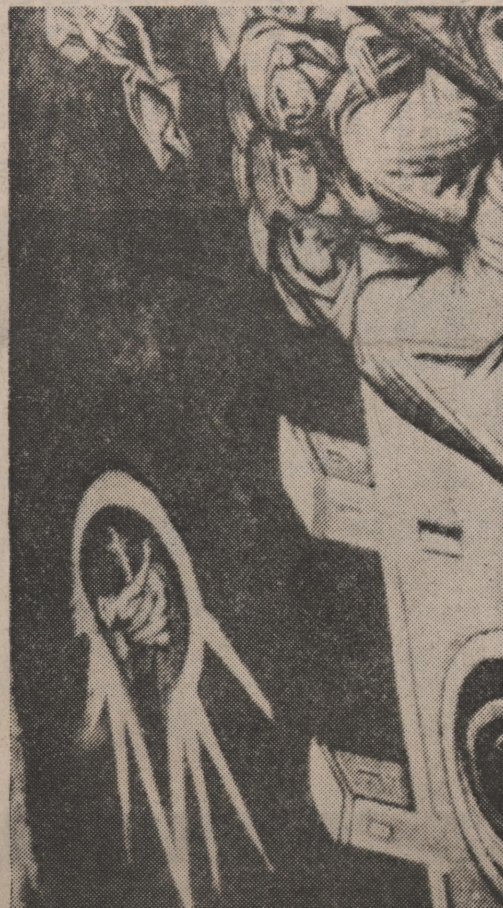
The amazing wall mural, below, was painted in the 1300s and incredibly shows what experts believe are UFOs in the corners. Above are blowups of the objects.