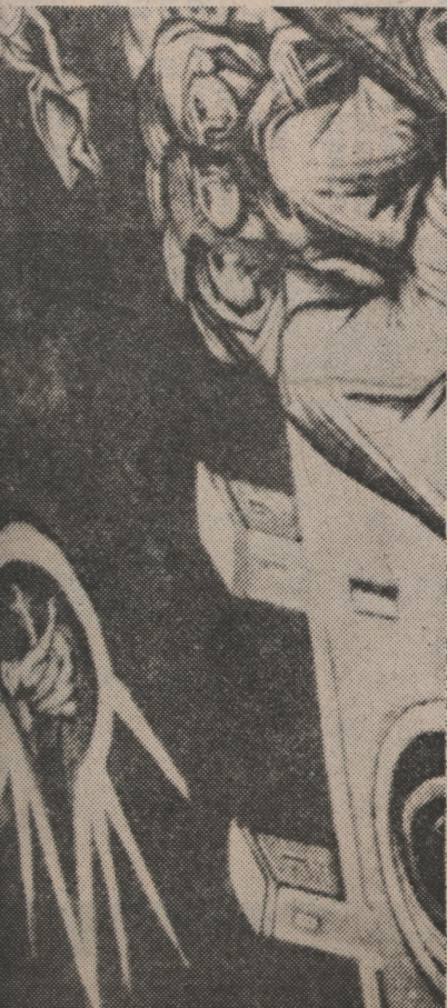
The amazing wall mural, below, was painted in the 1300s and incredibly shows what experts believe are UFOs in the corners. Above are blowups of the objects